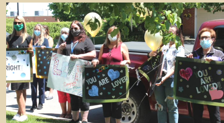
Special thanks to our Graduation Sponsors:

Canadian Federation of University Women (CFUW) * Sisters of the Good Shepherd Rotary Club Newmarket * Colleen Kelly Memorial * CWL Our Lady of Grace Parish Aurora